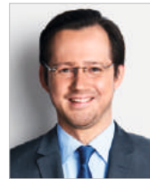
DIRK WIESE, MdB Member of German Bundestag, Chairperson of the German-Indian Parliamentary Group